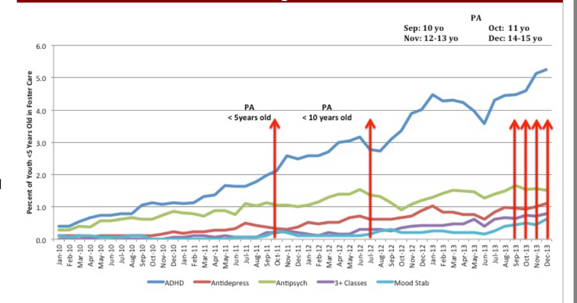
Figure 1. Psychotropic Trends for Youth <5 Years Old in January 2010 and Followed Through December 2013

Figure 1 shows that not until youth aged into the <10 years old pre-